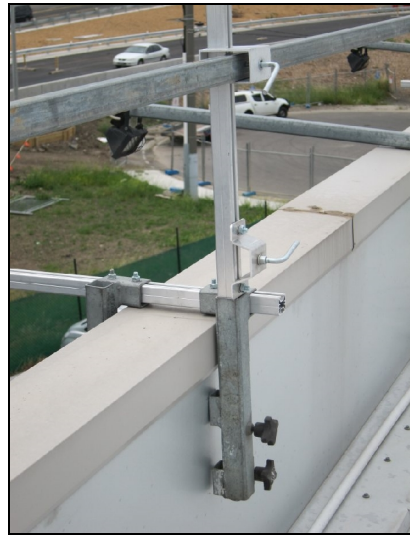
Figure 2: Clamp On Bracket