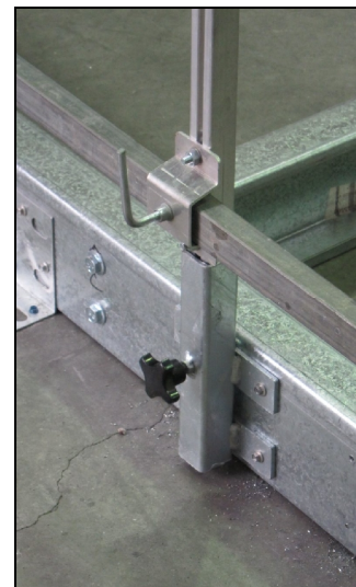
Figure 6: Gable End Bracket