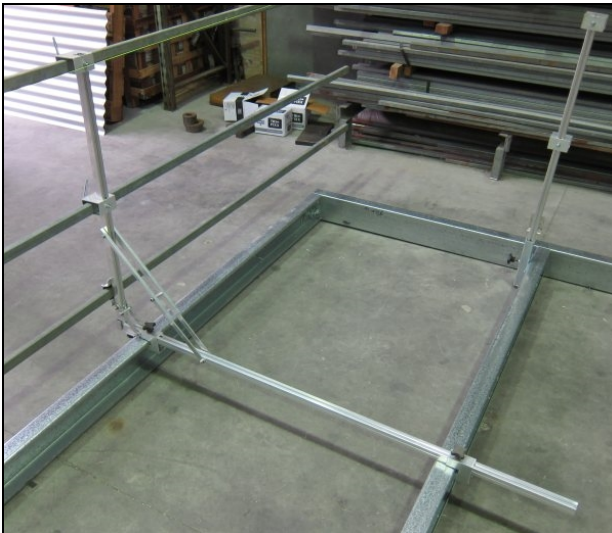
Figure 3: Perimeter Handrail with C-Purlin Clamp