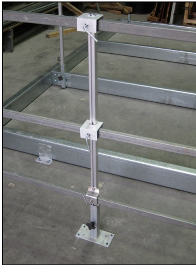
Figure 1: Bolt On Bracket